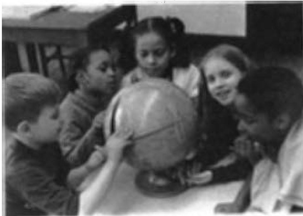
Art - Music Methods.