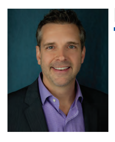
MESSAGE FROM THE PROVOST

Your interest in pursuing a graduate degree might be for many reasons, but ultimately you want to change your life for the better. It might be to advance your current career path. It might be to pursue a different career path. It might be to learn for the sake of learning. It might be to serve others at a higher level.